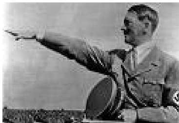
Hitler - Germany